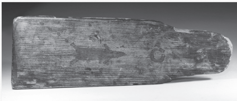
Painted miniature skin working board showing a swimming otter, AD 1400–1750, Koniag, Inc. Collection, Karluk One site.

Before the availability of commercially made pigments, Kodiak artists created paints from plants and minerals. Artists extracted colors from hemlock bark, grasses, and berries. They also created colorful powders by crushing red shale, iron oxide, copper oxide, charcoal, or even sparkling molybdenite with a mortar and pestle, and mixed the resulting powder with a binder of oil or blood. Artists applied paint to objects with their fingers, a small stick, or possibly a paintbrush made with animal hair.