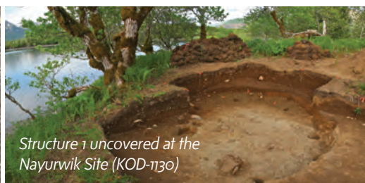
Structure 1 uncovered at the Nayurwik Site (KOD-1130)

About 6,300 years ago, an Alutiiq family camped on the shore of Sitkalidak Passage. Here, they built a small, sturdy, oval house. Partially dug into the ground, this building had a wood frame and probably wooden walls. It also had a thick, insulating cover of sod. Inside the structure residents crafted stone hunting tools, using both local materials and rock from the Alaskan mainland. Just outside the structure they ground iron oxide to make a red pigment. This pigment may have been used to preserve hides. It was found all over the house floor. Perhaps people sat on hides inside the house.