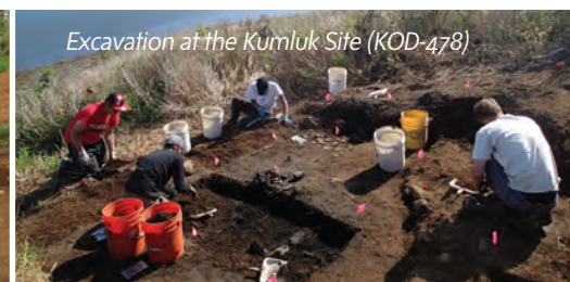
Excavation at the Kumluk Site (KOD-478)

In front of the houses there was ancient garbage. Animal remains from these piles show that residents harvested cod, salmon, shellfish, and birds. Archaeologists believe that people lived here in the fall or early winter, but not year round. The residents of this small settlement were probably members of a larger village located nearby.