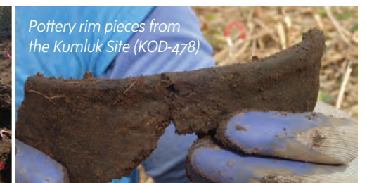
Pottery rim pieces from the Kumluk Site (KOD-478)