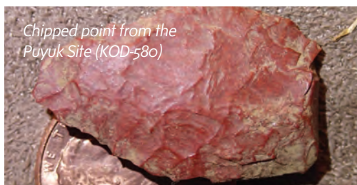
Chipped point from the Puyuk Site (KOD-580)

Some of the first visitors to Midway Bay stopped along the shore of a protected cove by a stream. Here they made stone tools and built a round structure. This building is one of the oldest ever studied in the Alutiiq world. It had a wood frame, a sod roof, and a gravel floor. There was a pit in its center surrounded by charcoal, fire heated rocks, and burned soil. Archaeologists found few artifacts inside and think that the building may have been a smokehouse. Tools found outside show that they crafted cutting implements and hunting gear. Some of the stone they used came from the Alaska mainland.