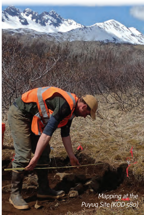
Mapping at the Puyuk Site (KOD-580)