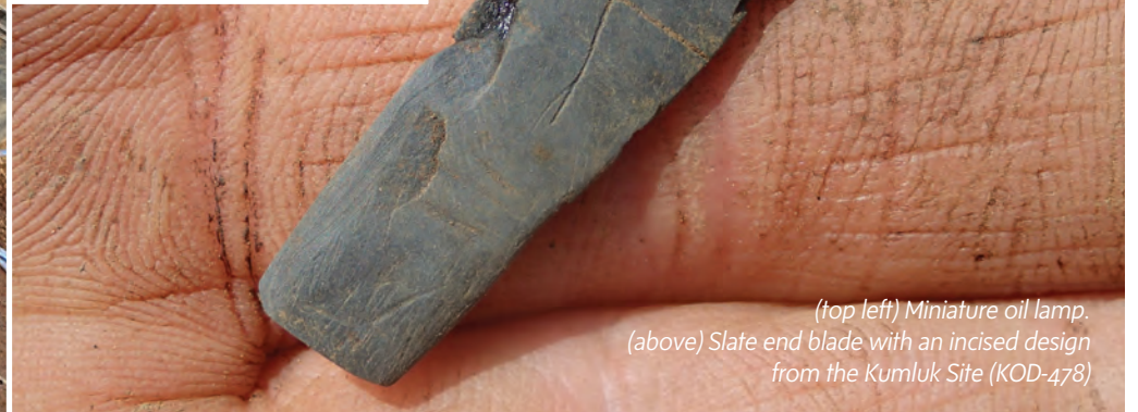
(top left) Miniature oil lamp. (above) Slate end blade with an incised design from the Kumluk Site (KOD-478)