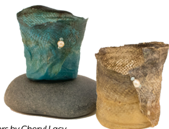
Salmon skin containers by Cheryl Lacy