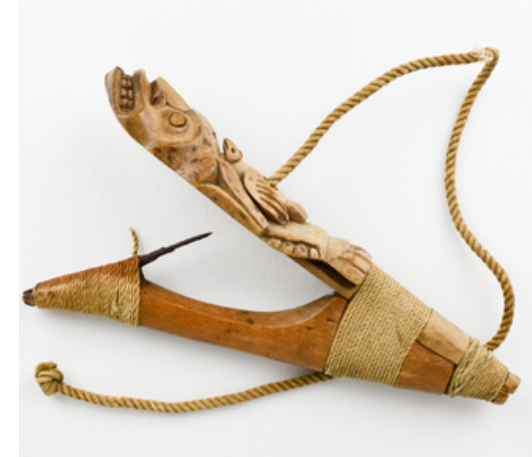
Alutiiq Museum Halibut Hook