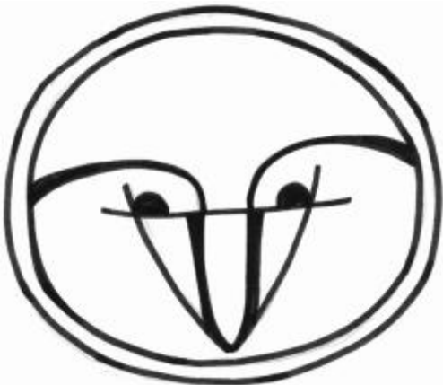
Iikauwiitii - Sparrow