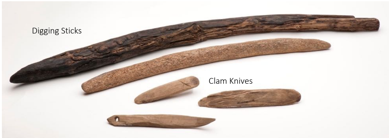
Figure 8.10. Digging sticks (top) and clam knives (bottom) from Karluk One (AM193).

m = term in modern usage, c = term created by Elder Alutiiq speakers