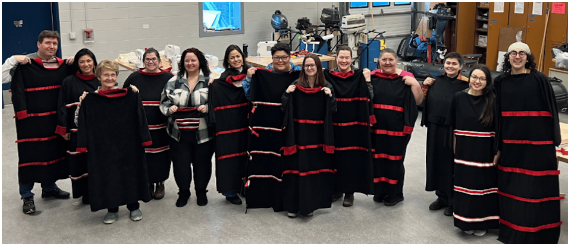
Participants in the Atkuk —Parka Making Workshop, 2024.