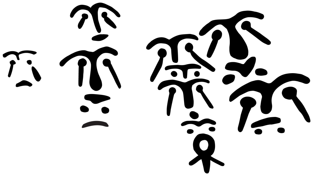
Petroglyph cluster from Afognak Island.

Hundreds of years ago, Alutiiq people carved faces, animals, boats, and other pictures into boulders along Kodiak’s coast. These carvings are called petroglyphs. People made them by pecking—hitting a rock against a boulder to create a design. Sometimes the carvings are in groups. These may be pictures of Alutiiq families who lived nearby and harvested fish and animals from the surrounding land and water.