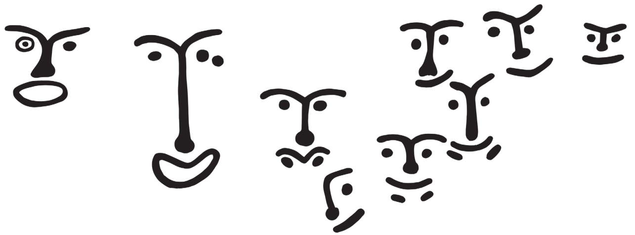
Petroglyph cluster from Cape Alitak.