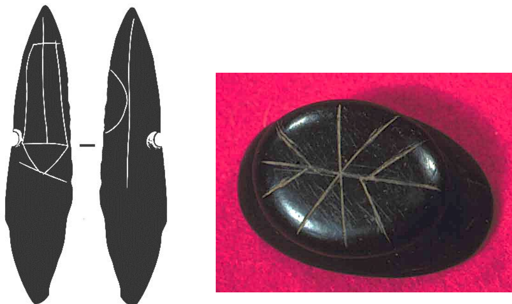
Figure 6.1. Examples of stone objects with incised designs.

From left: Incised slate knife, Horseshoe Cove site; Coal labret from the Uyak site.