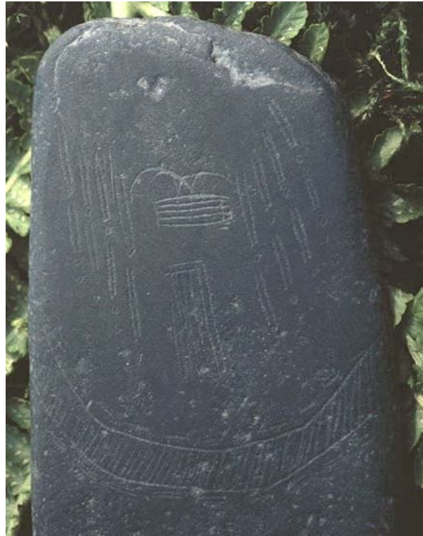
Incised Stones from the Settlement Point site showing face, jewelry, and clothing elements.