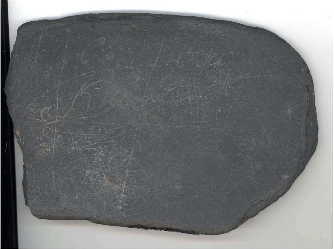
Pebble with writing and drawing from Igvak, AFG-016.