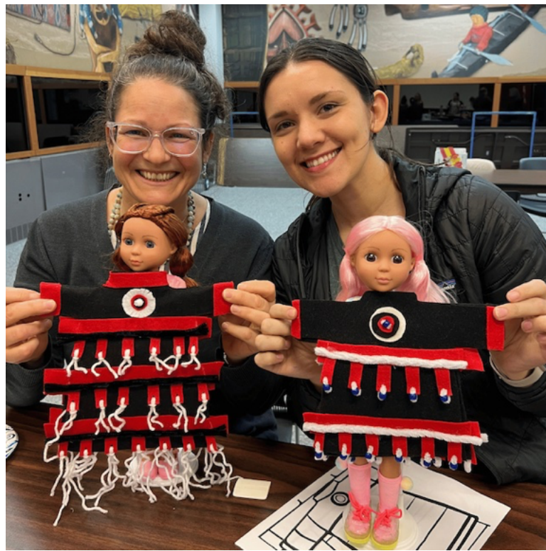
Educators with Alutiiq doll parkas.

Outfit your child's doll with an Alutiiq/Sugpiaq parka, or make a parka craft. We have two new activities designed by artist Hanna Sholl. Both use widely available materials—felt, thread, and pipe cleaners. Find instructions at the link below with a supply list and photos to guide you.