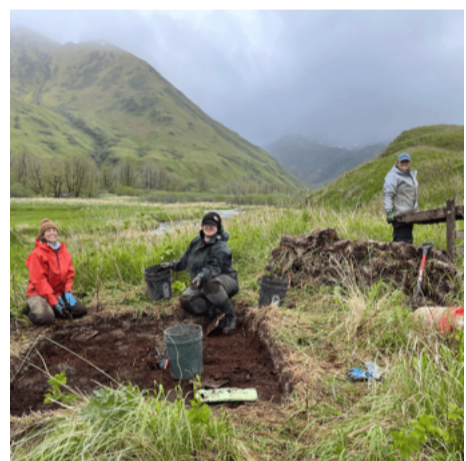
Santa Flavia Bay