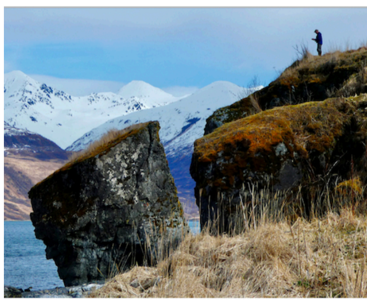
Kodiak Archaeology: A Guide to Sites, Artifacts, and Historic Preservation