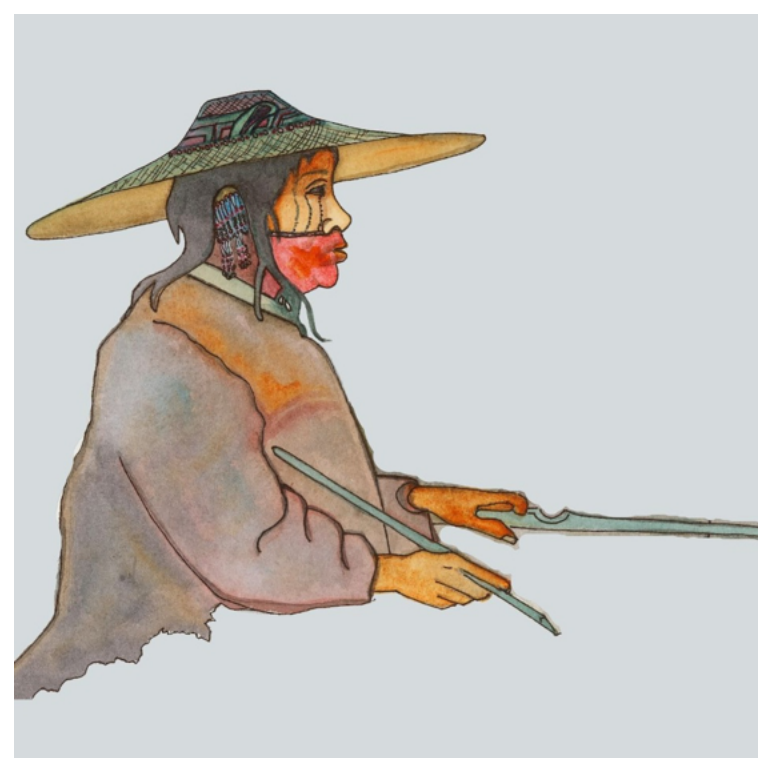
Afognak Man, 1817, watercolor by Helen Simeonoff