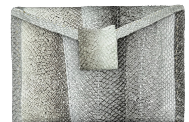
Salmon skin bag by June Pardue

Summer provides many materials for Alutiiq artists and our store is filled with their beautiful creations. Support culture and creativity. Shop local. Shop Alutiiq.