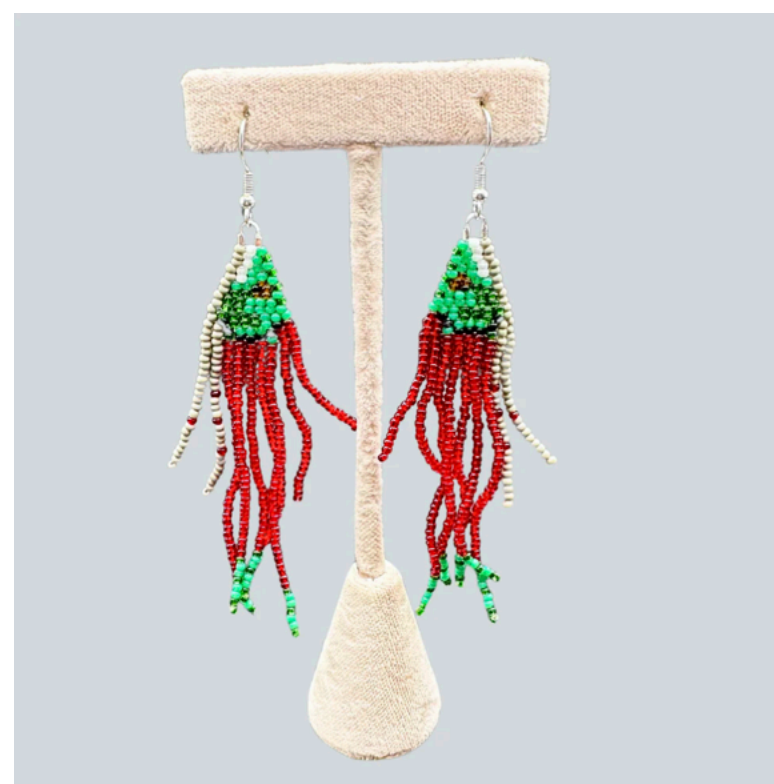
Salmon earrings by Camille Hintz