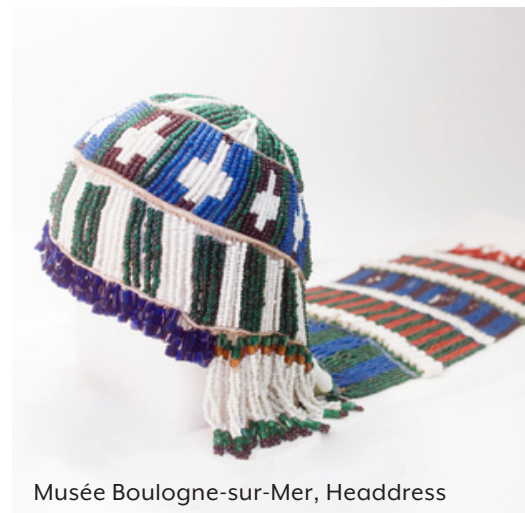
Musée Boulogne-sur-Mer, Headdress