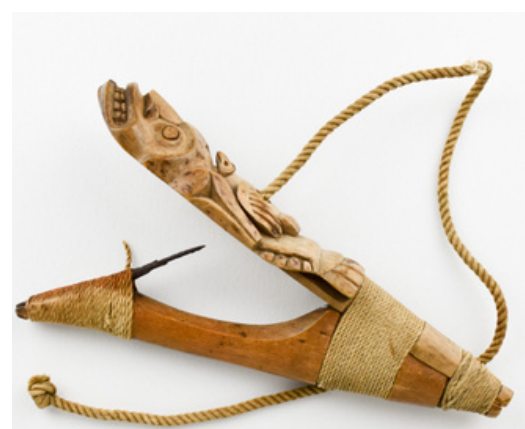
Alutiiq Museum Halibut Hook