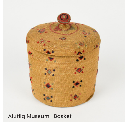
Alutiiq Museum, Basket