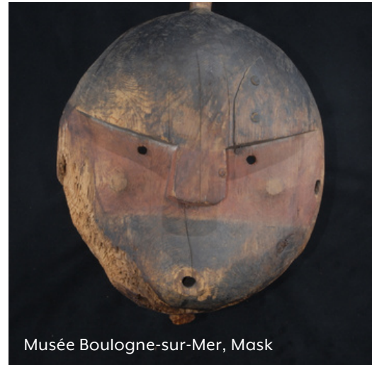
Musée Boulogne-sur-Mer, Mask

215 Mission Road, Suite 101 Kodiak, AK 99615 844-425-8844, alutiiqmuseum.org