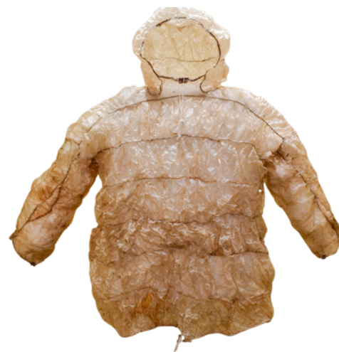
Sitka Historical Society Museum, Jacket