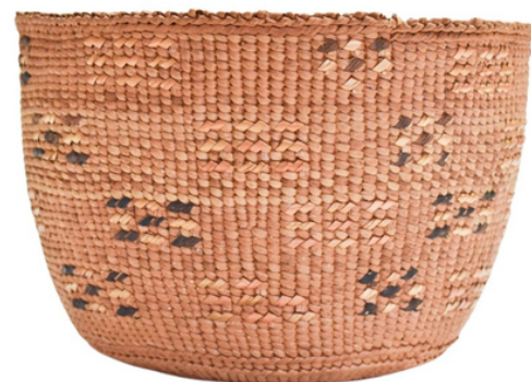
Sheldon Jackson Museum, Basket