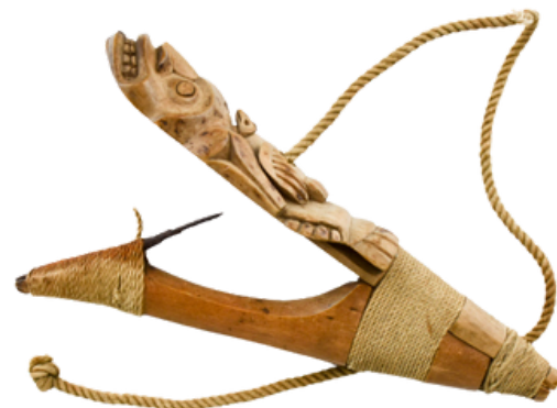
Alutiiq Museum Halibut Hook