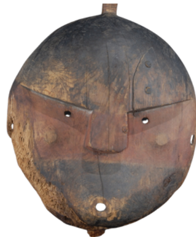
Musée Boulogne-sur-Mer, Mask

215 Mission Road, Suite 101 Kodiak, AK 99615 844-425-8844, alutiiqmuseum.org