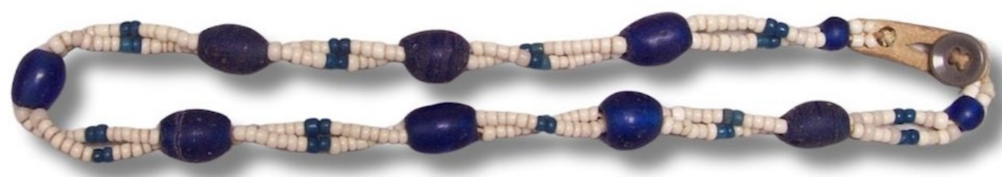
Uyamilliquaq —Beaded necklace, Anchorage Museum collections.