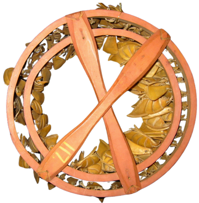
Puffin Beak Rattle, Courtesy of the National Museum of Finland, Etholén Collection.