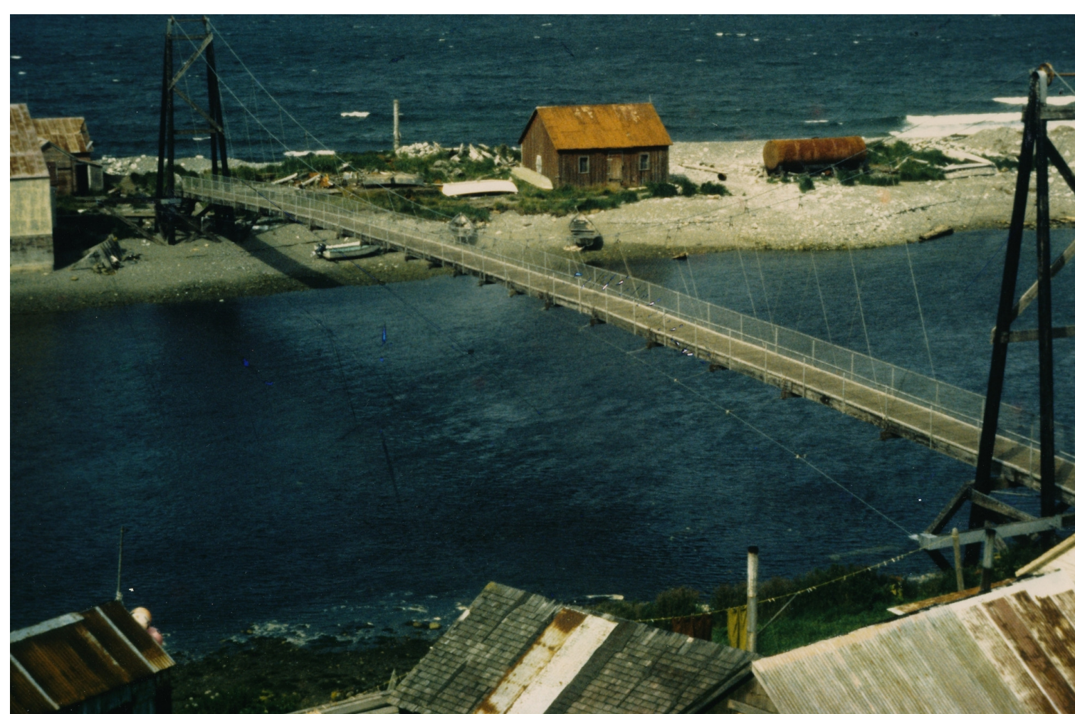
Karluk Bridge, 1976.

Available to view at the Alutiiq Museum May 1st - May 22nd.